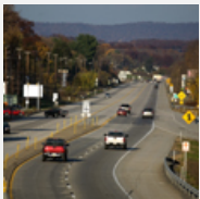
View photo galleries